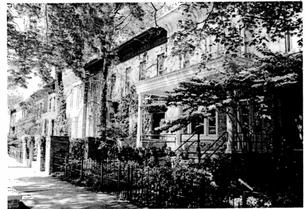
Two views of the Fremont Row House District.